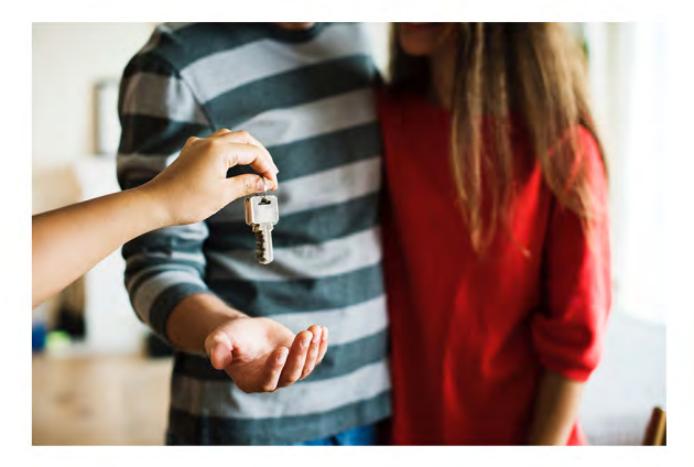
Interpreting available for clients who are deaf, hard of hearing, or who speak a language other than English.